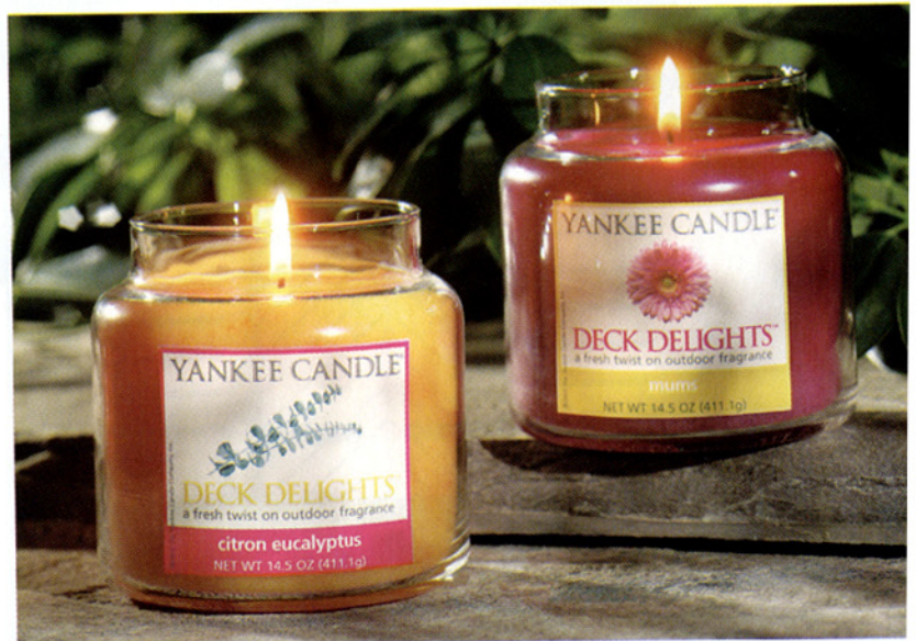
A tropical blend of lemon citron and eucalyptus and the peppery accent of bright fall mums are center stage in the new line of Deck Delights candles from Yankee Candle , that combine ingredients to repel insects while enjoying time outdoors ($17, each). eLink 540