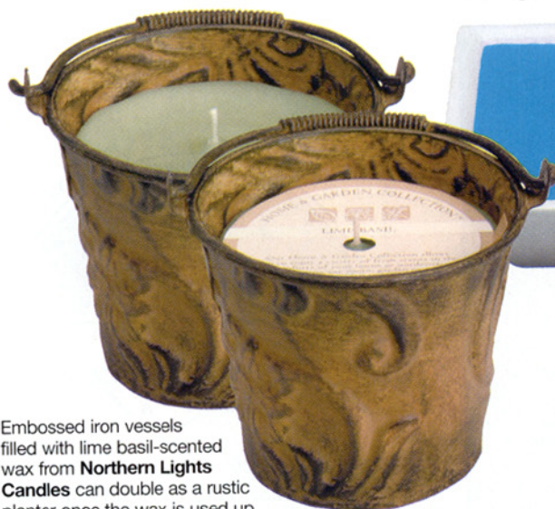
Embossed iron vessels filled with lime basil-scented wax from Northern Lights Candles can double as a rustic planter once the wax is used up ($9, small; $15, medium). eLink 539