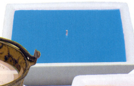
Eye-popping colors in cool green, pink, orange and blue fill white square cachepots from Boston Warehouse , a retro take on citronella candles ($8, each). eLink 534